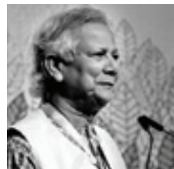
Professor Muhammad Yunus Noble Peace Prize Recipient 2006, Bangladesh