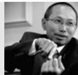
Tan Sri Dato' Sri Abdul Wahid Omar Former Minister, Prime Minister's Department, Malaysia